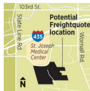
THE KANSAS CITY STAR

An official at Freightquote confirmed Wednesday the firm is looking at sites in Kansas and Missouri. Kansas City economic development officials are pushing 30.5 acres south of St. Joseph Medical Center near the intersection of Interstate 435 and State Line Road.